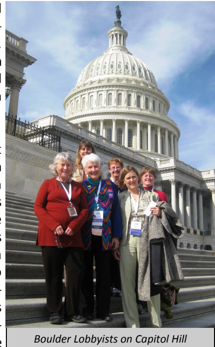
Boulder Lobbyists on Capitol Hill