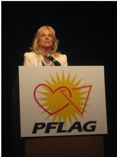
Dr. Jill Biden, Second Lady

The PFLAG National Convention was opened by Dr. Jill Biden, the Second Lady, a mom, a grandmother, life-long educator and a much sought-after speaker. One of her aides, who is gay, convinced Dr. Biden to choose PFLAG as one of her many speaking invitations because of what PFLAG meant to him and his family. After her affirming words of support for the PFLAG mission, she walked backstage to see her aide in tears. Both wept as they embraced with a new bond of understanding.