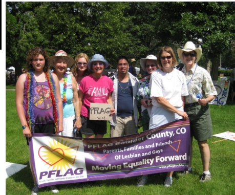
On the right: Some Boulder PFLAGers who marched in the 2010 Pride March.